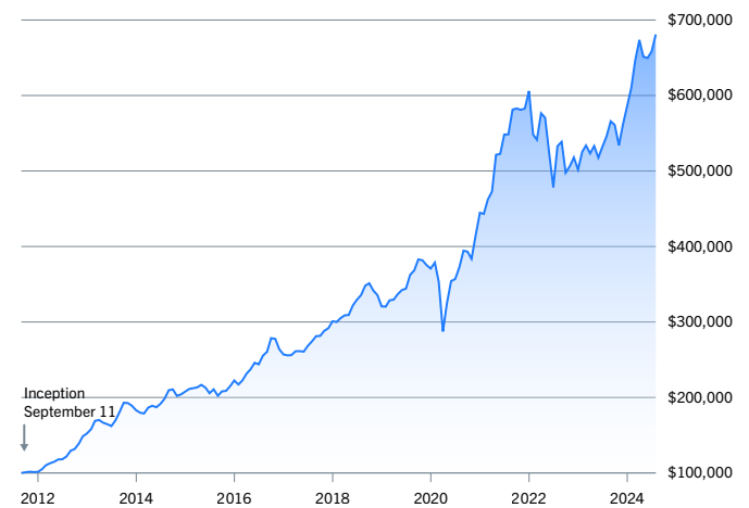
● Australasian Dividend Growth Fund

If you had invested $100,000 at inception, the graph below shows what it would be worth today, before tax.