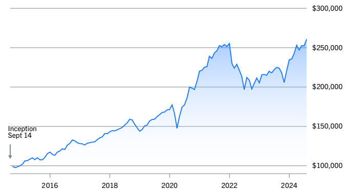
● Chairman's Fund

If you had invested $100,000 at inception, the graph below shows what it would be worth today, before tax.