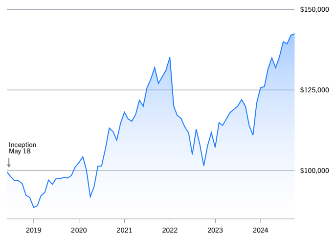
● Global Growth 2 Fund

If you had invested $100,000 at inception, the graph below shows what it would be worth today, before tax.